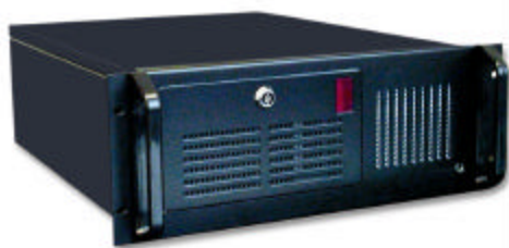
Falcon 616 System

Enhanced Compression Technology Enhanced Picture Resolution Simultaneous Remote Multi-Site Monitoring Remote Site Monitoring & Playback Remote Setup