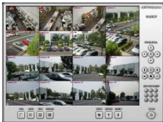
Client Software User Interface